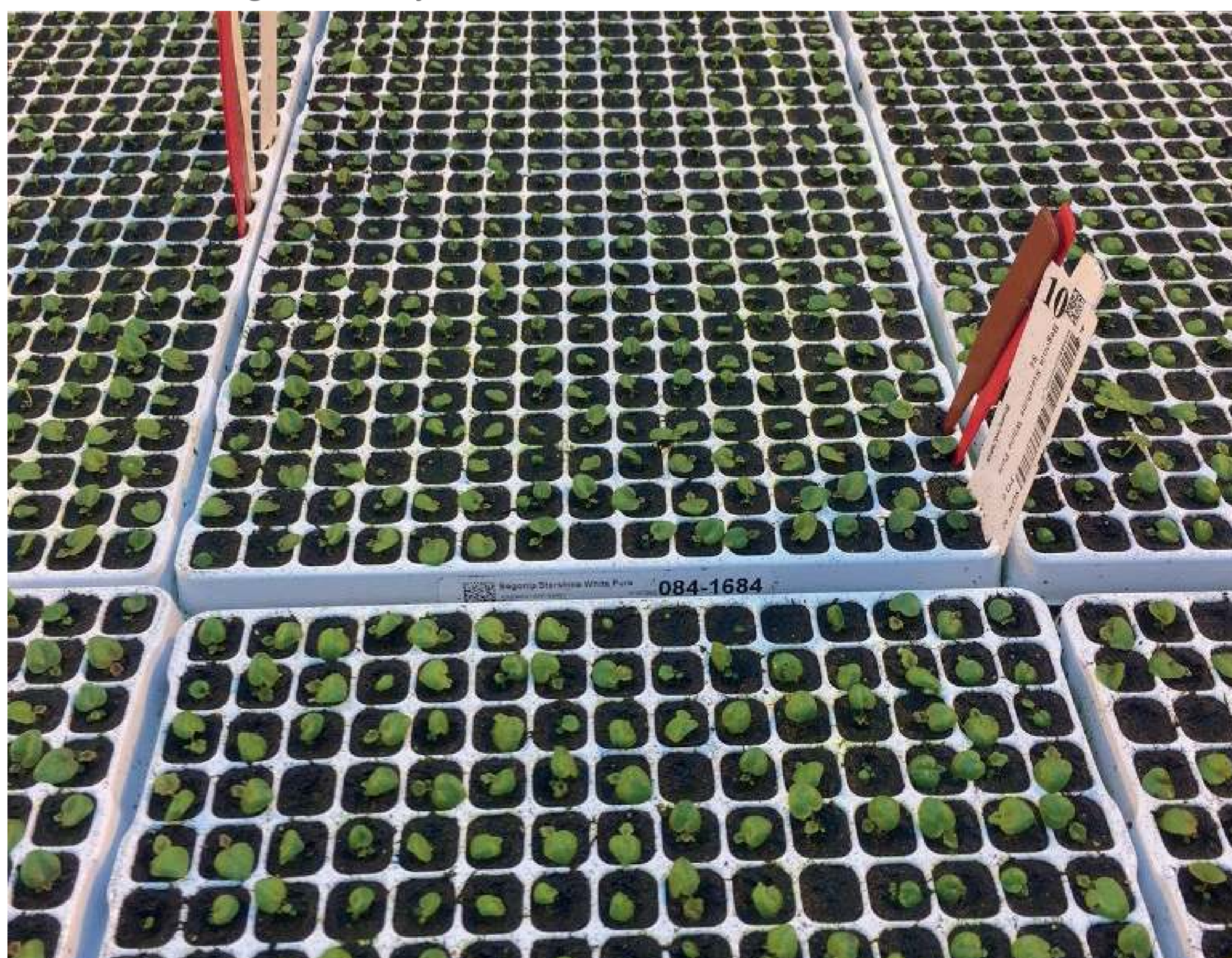
Bossa Nova plugs at 30 days